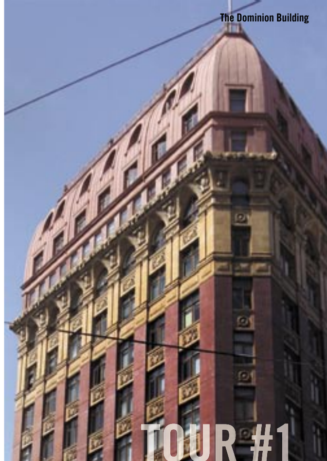
The Dominion Building