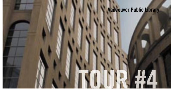
Vancouver Public Library