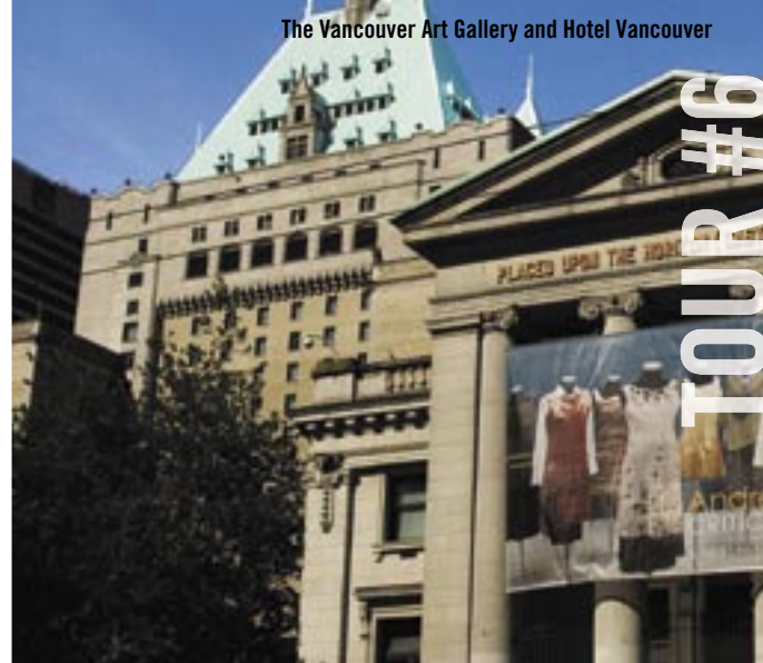
The Vancouver Art Gallery and Hotel Vancouver

Meet the AIBC tour guide at 1:00 p.m. in the lobby of the Architecture Centre, 440 Cambie (between Pender and Hastings). Tour ends at the Roundhouse Community Centre (corner of Davie & Pacific).