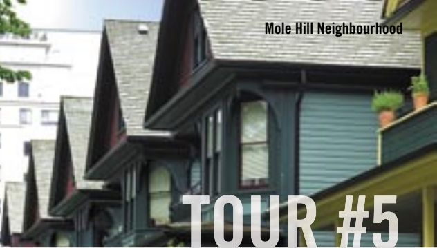
Mole Hill Neighbourhood