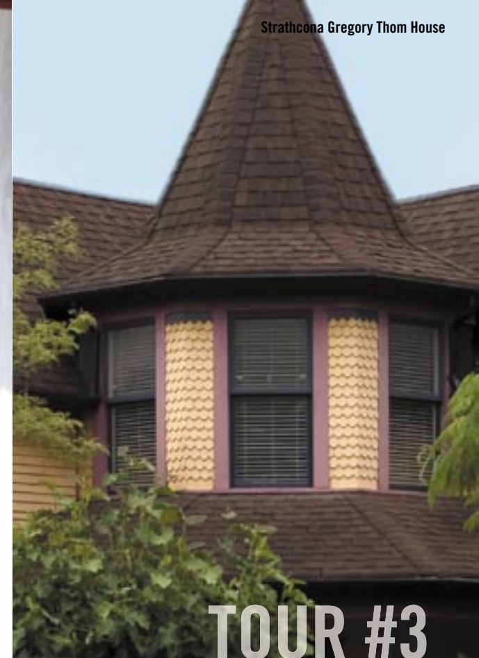
Strathcona Gregory Thom House

Meet the tour guide at 1:00 p.m. in the lobby entrance of the Architecture Centre, 440 Cambie (between Pender and Hastings). Tour ends at the Dr. Sun Yat-Sen Park (corner of Carrall & Keefer).