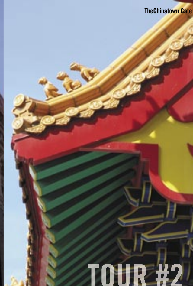
The Chinatown Gate

Meet your tour guide at 1:00 p.m. in the lobby entrance of the Architecture Centre, 440 Cambie (between Pender & Hastings). Tour ends at the same location.